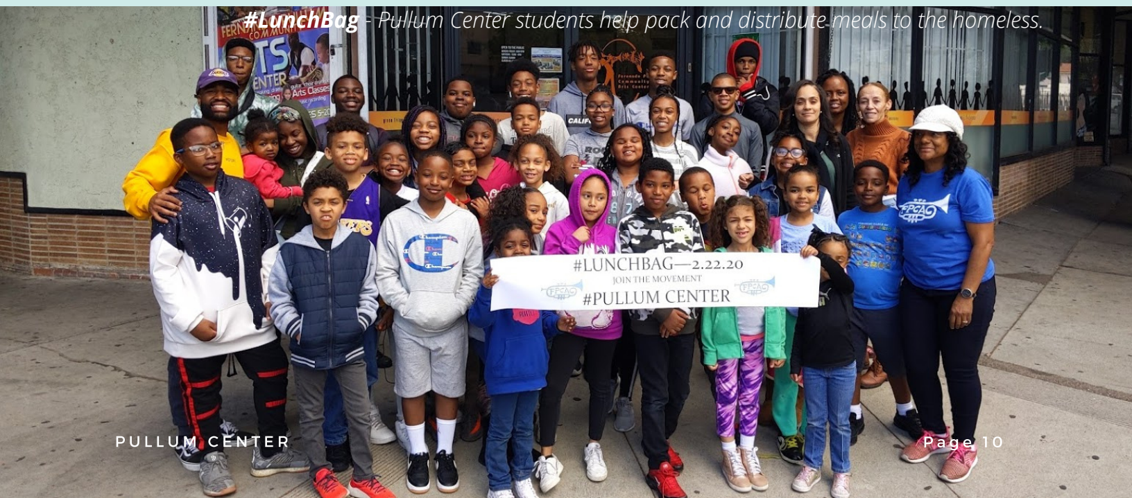
#LunchBag - Pullum Center students help pack and distribute meals to the homeless.