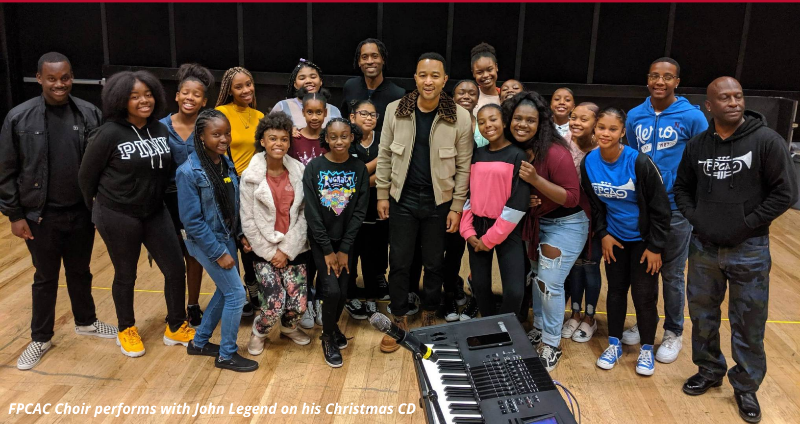
FPCAC Choir performs with John Legend on his Christmas CD