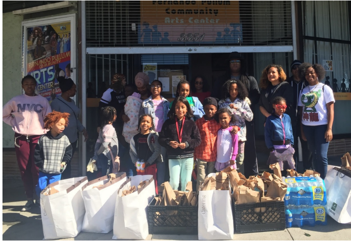
Pullum Center students prepare to distribute lunch bags they have prepared for the homeless in Leimart Park. March 23, 2019