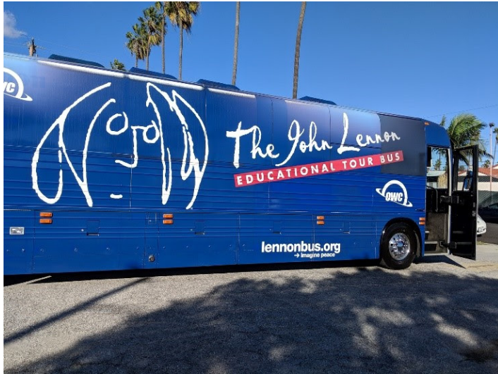
A fully equipped recording and video studio on wheels

students experience with producing original music in a professional setting.