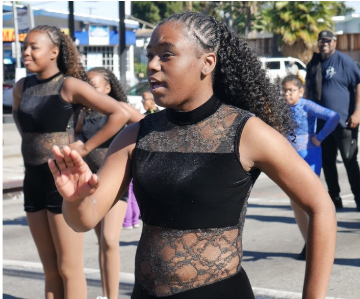
Dance team in action