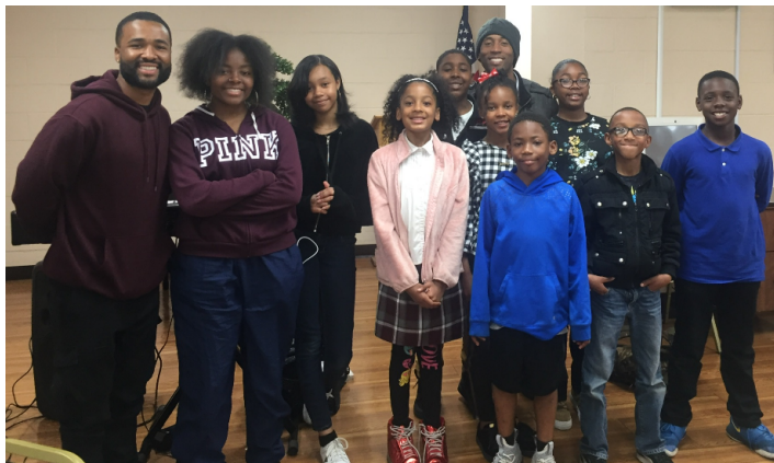
Pullum Center Drama Class performs at Good Shepherd Seniors Community. March 28, 2019