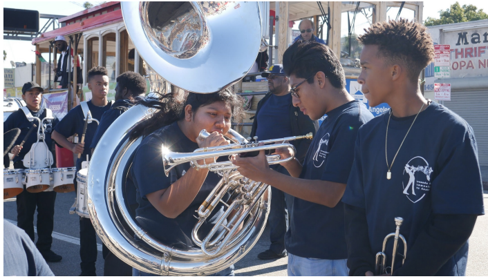
Band members prepare for the march

sidewalks to see it. The parade was televised to the Los Angeles market.