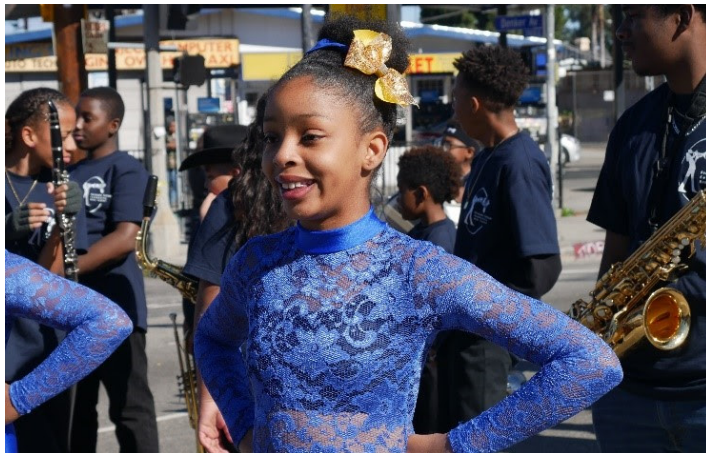
Dance team prepares to march