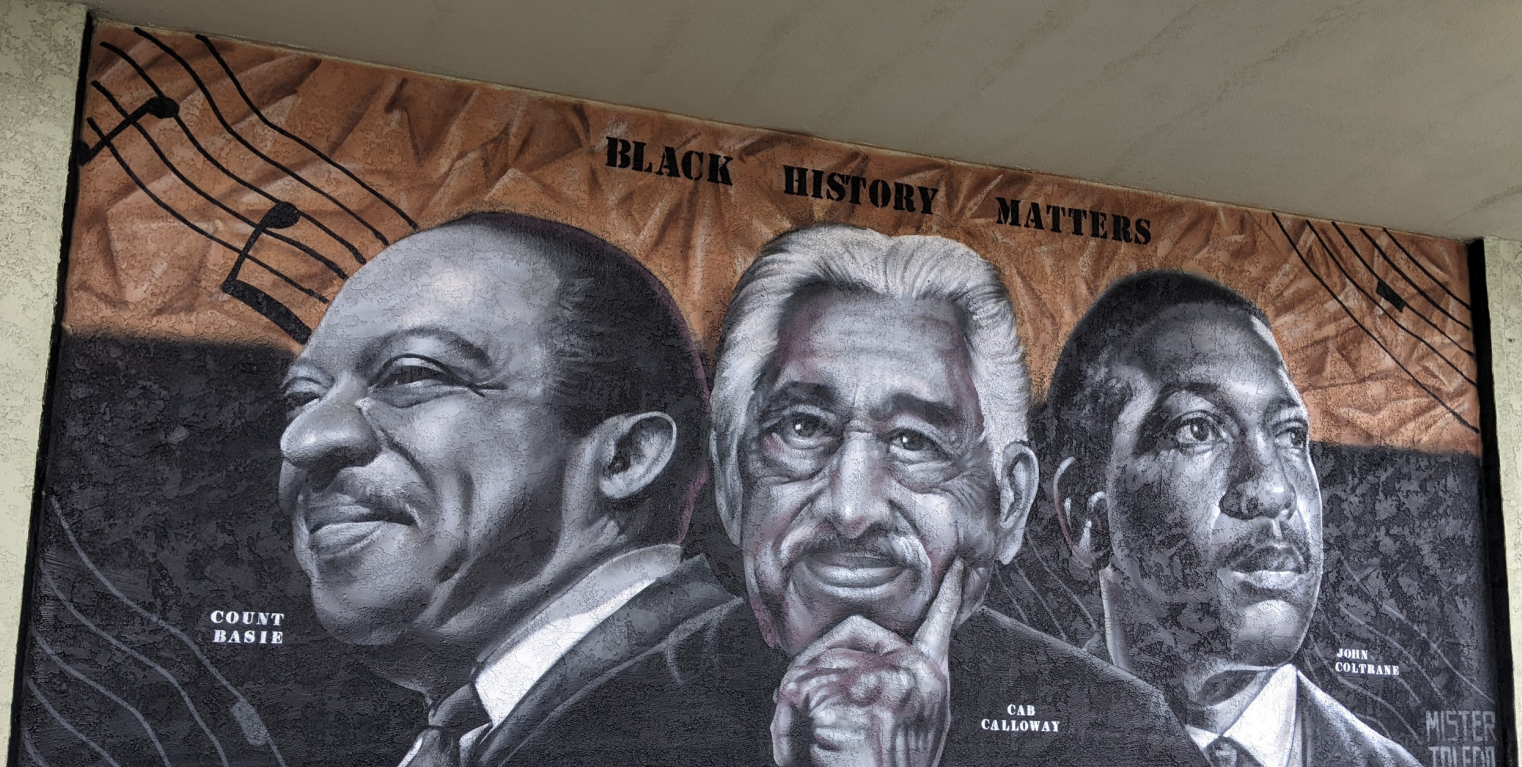
A new mural featuring Count Basie, Cab Calloway and John Coltrane was added to the Pullum Center building in celebration on Black History month in 2022.