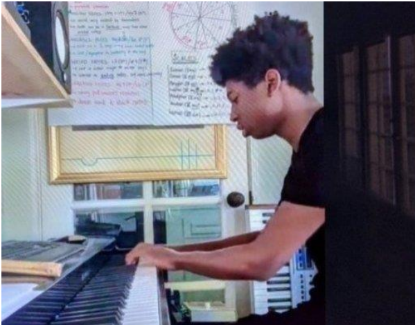
Student performs for Wynton Marsalis