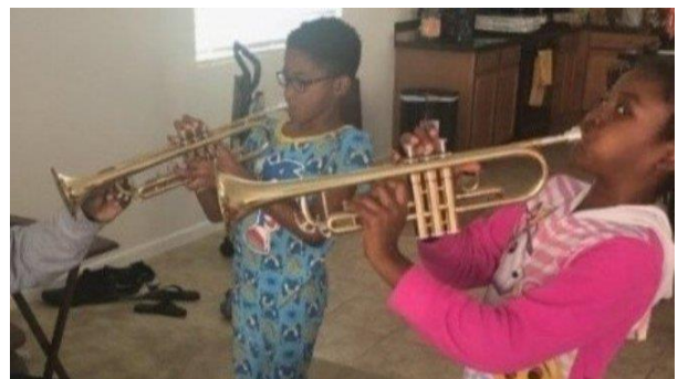
Students with their new trumpets attending beginner instrument class