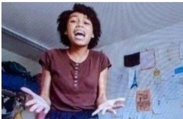
Acting student responds to Jack Bender

Click here to see a clip from a master class with Wynton Marsalis!