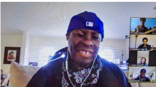
Student receives valuable advice from Kamasi Washington